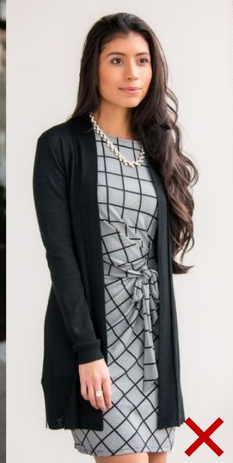
PATTERNS & PRINTS